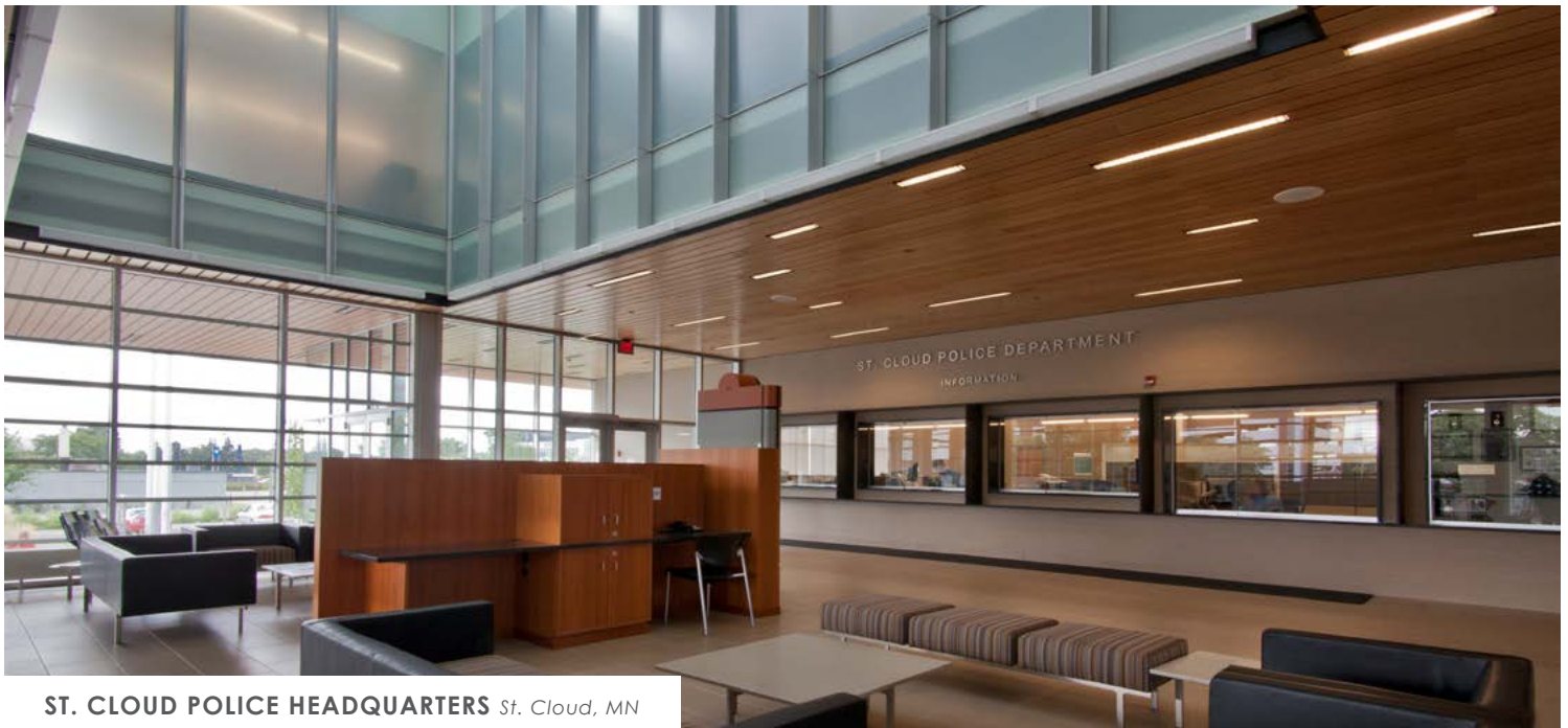
ST. CLOUD POLICE HEADQUARTERS St. Cloud, MN