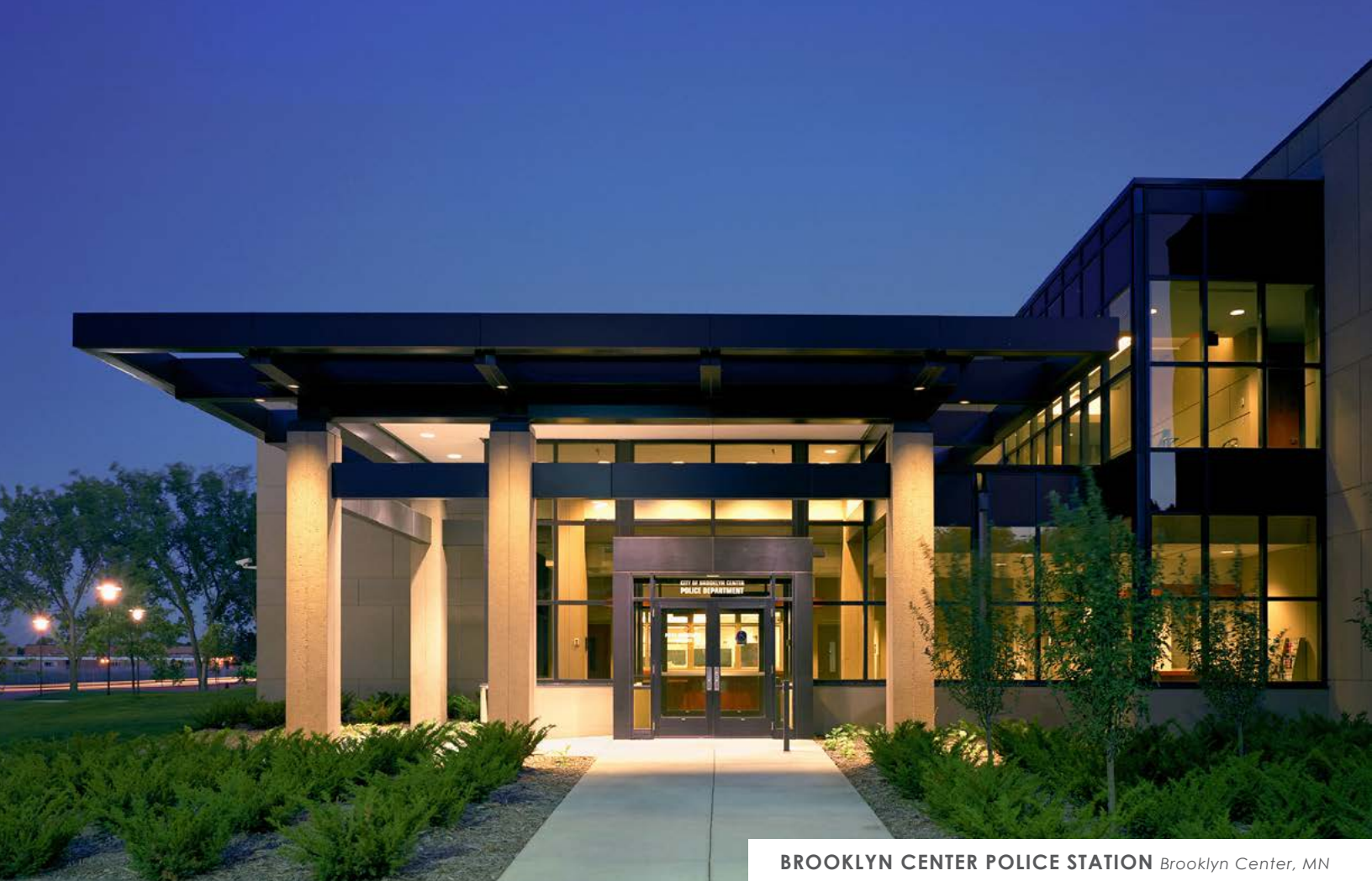
BROOKLYN CENTER POLICE STATION Brooklyn Center, MN