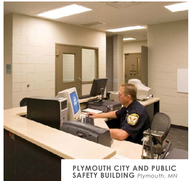
PLYMOUTH CITY AND PUBLIC SAFETY BUILDING Plymouth, MN