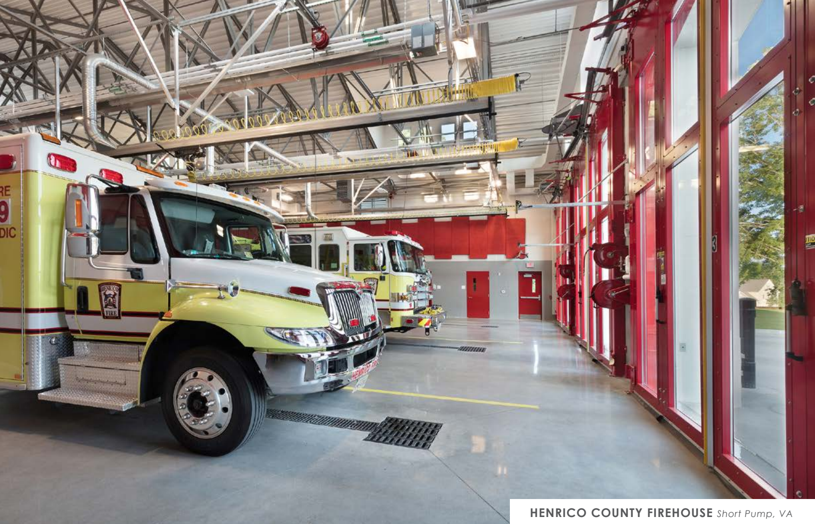
HENRICO COUNTY FIREHOUSE Short Pump, VA