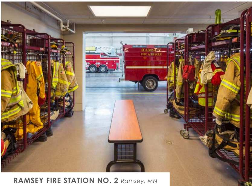
RAMSEY FIRE STATION NO. 2 Ramsey, MN

BKV Group's integrated team has successfully completed more than 85 fire station projects across the country. We maintain an in-house research program dedicated to ongoing analysis of the latest national discussions, programmatic trends, and emerging construction technologies to provide better buildings for our clients. BKV Group is a client-focused design firm that understands the process of project management. Our highly experienced staff fosters an atmosphere of cooperation to make the process as fun and collaborative as possible.