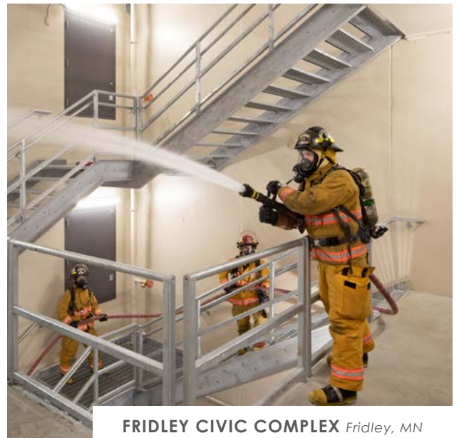
FRIDLEY CIVIC COMPLEX Fridley, MN